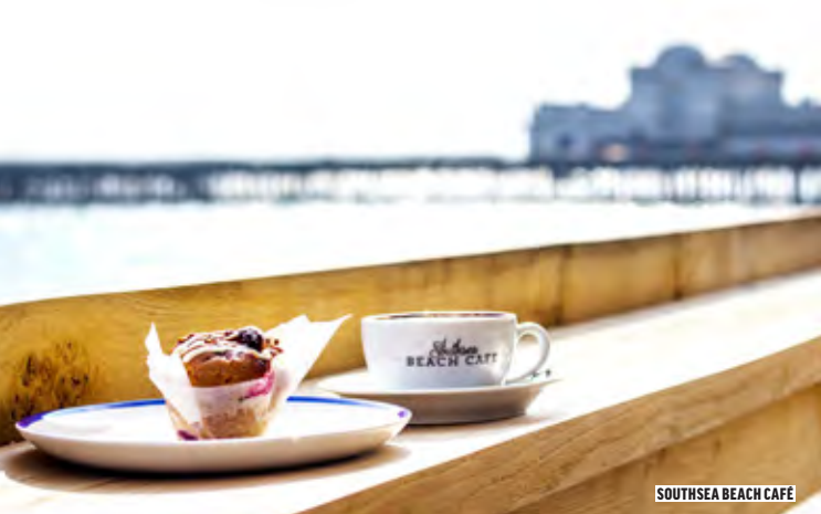
SOUTHSEA BEACH CAFE