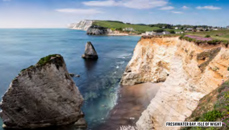
FRESHWATER BAY, ISLE OF WIGHT