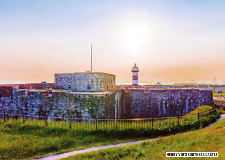
HENRY VIII'S SOUTHSEA CASTLE