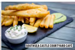
SOUTHSEA CASTLE COURTYARD CAFE