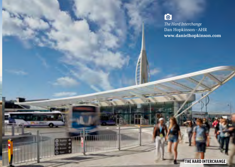
THE HARD INTERCHANGE