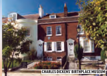
CHARLES DICKENS' BIRTHPLACE MUSEUM