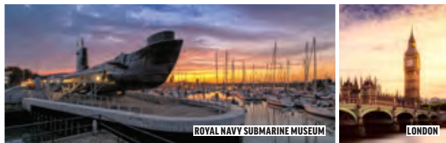
ROYAL NAVY SUBMARINE MUSEUM

London is just 90 minutes away by train or coach, it couldn't be easier to take a day trip to the capital.