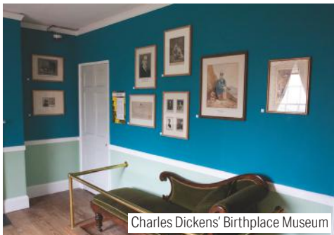
Charles Dickens' Birthplace Museum