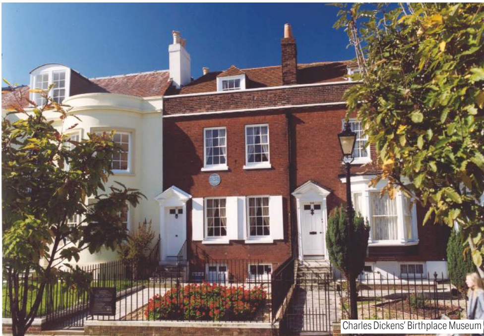
Charles Dickens' Birthplace Museum