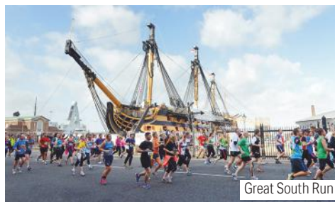
Great South Run