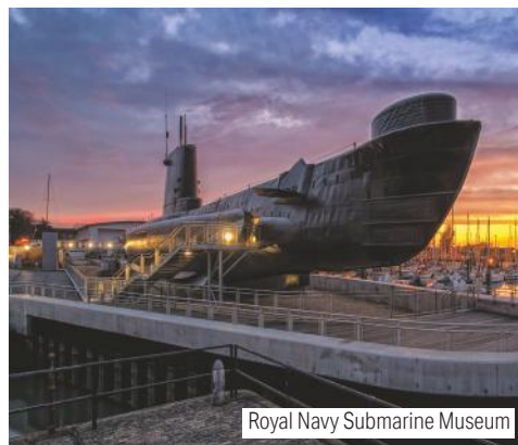
Royal Navy Submarine Museum