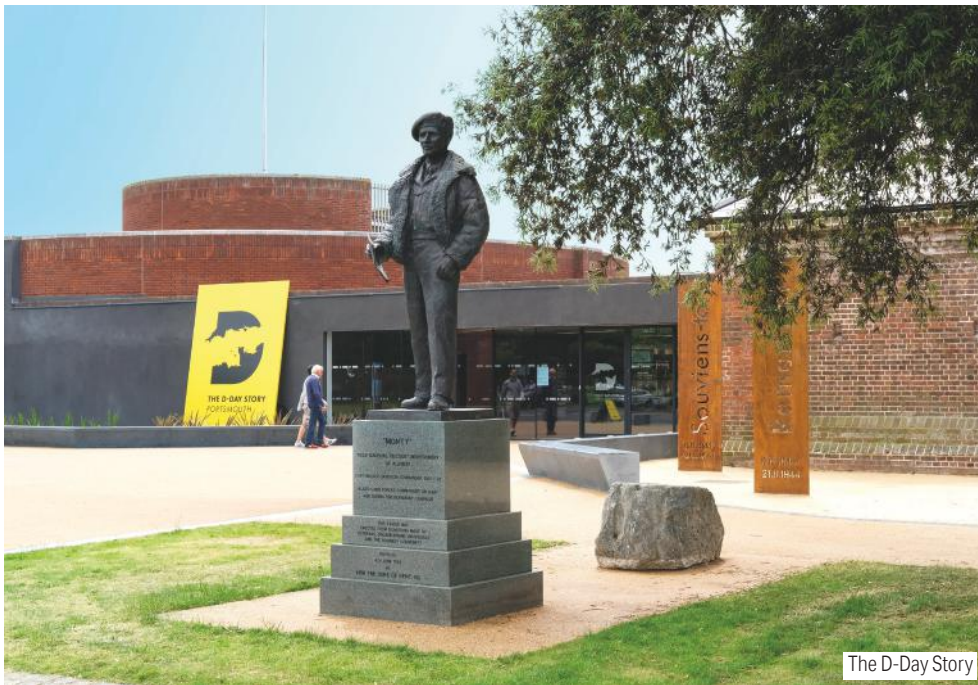
The D-Day Story