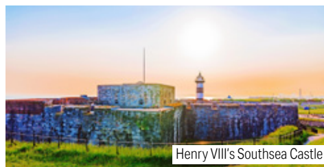
Henry VIII's Southsea Castle