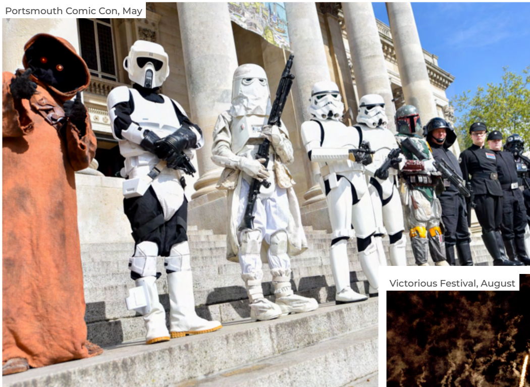
Victorious Festival, August