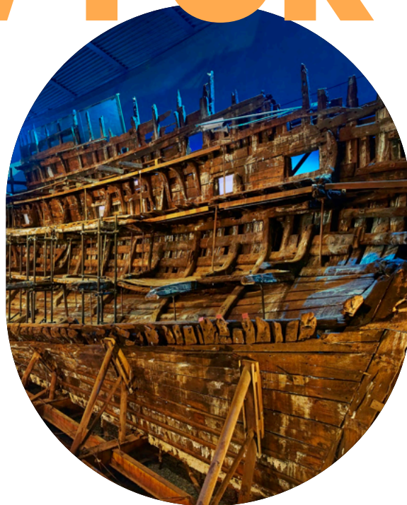
Left to right: HMS Victory, Portsmouth Historic Dockyard. Mary Rose. South Parade Pier. Spinnaker Tower.