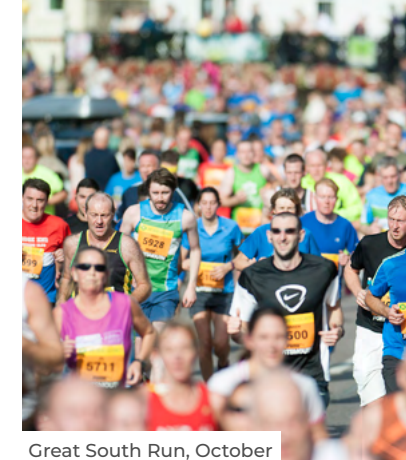
Great South Run, October