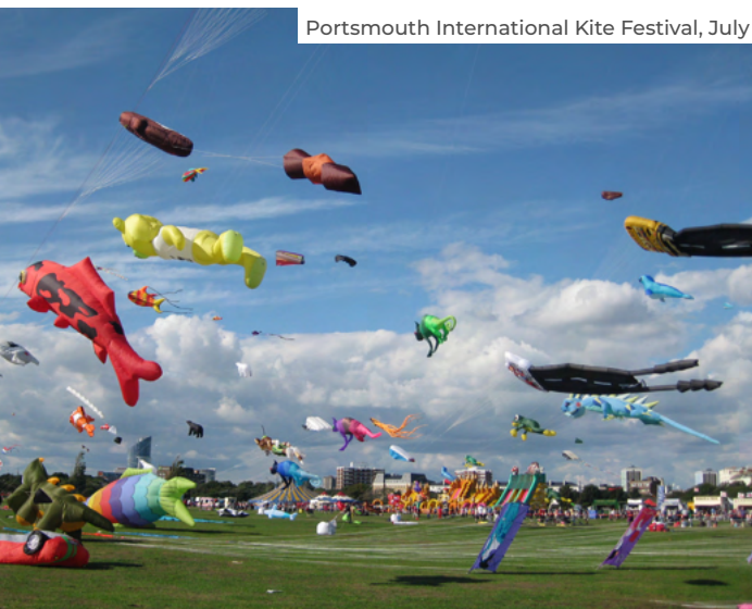
Portsmouth International Kite Festival, July

Pantos (Cinderella at Kings Theatre/ Sleeping Beauty at New Theatre Royal) Portsmouth On Ice